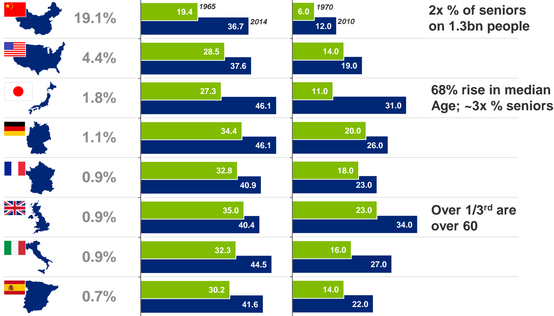
% of Population over 60 by Country, 1970 vs 2010